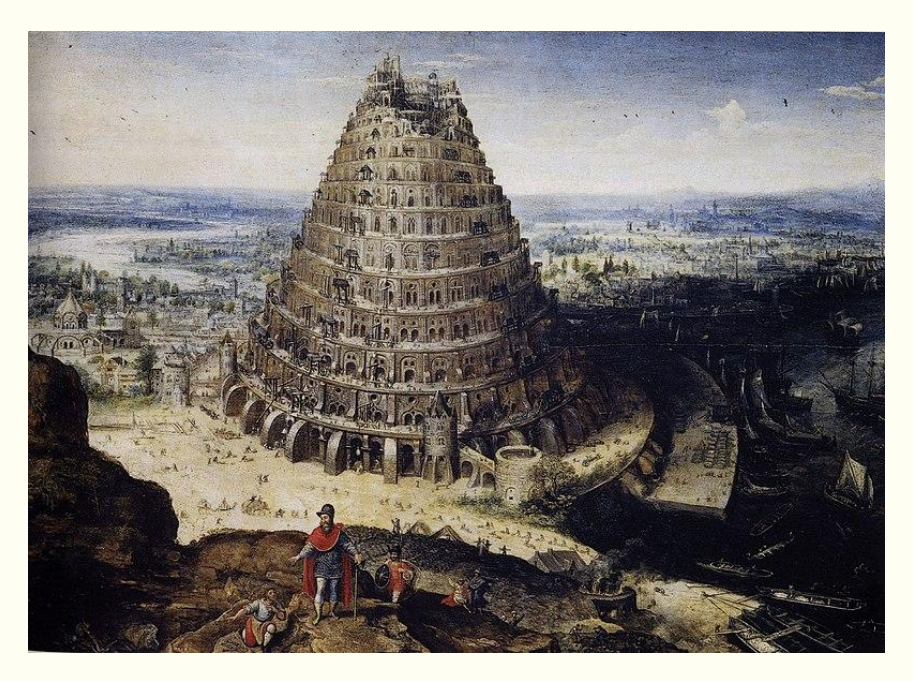
Tower of Babel